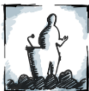
Advisory so security leaders