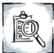
Cyber Due Diligence