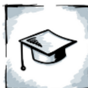
Cyber Security Awareness