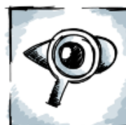
Cyber Security Road Map