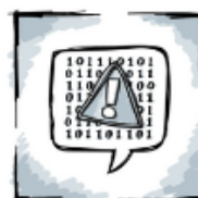
Communicating cyber risk and security