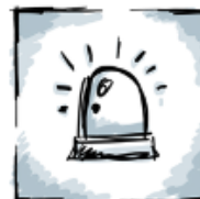
Cyber Security Governance