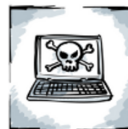
Cyber Risk Management